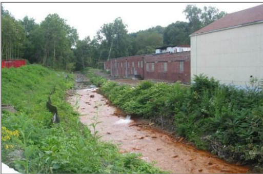
The Irwin AMD Discharge at Tinkers Run