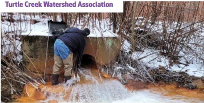
Turtle Creek Watershed Association

In October 2025, TCWA was honored to be chosen as one of only 100 local nonprofit organizations featured in the Pittsburgh Wish Book , a publication of the Pittsburgh Foundation and Community Foundation of Westmoreland County. This year's Wish Book featured 100 nonprofits in areas critical to our region's success: arts and culture, basic needs, economic mobility, environmental action, equity and social justice, and more. TCWA has already received $500 from one generous donor via the Wish Book and also a matching grant of $5000 from the Pittsburgh Foundation.